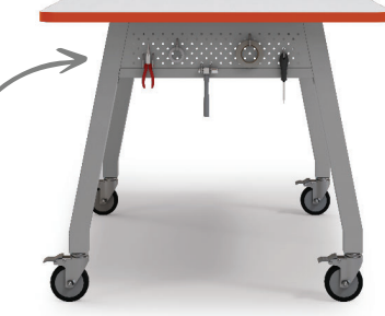
All tables are designed with extra support bars to increase stability along with peg board side panels for easy access to small equipment and tools.