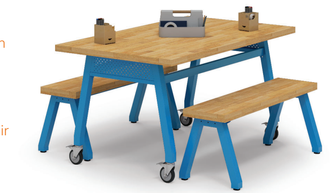
Shown with Butcher Block Top and Footrests