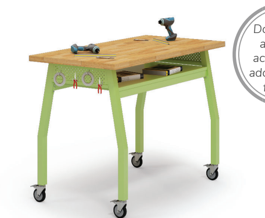
Don't forget about the accessories: add a shelf or footrest!